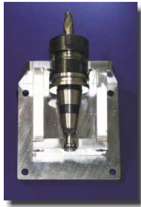
Tool Holder with ISO 30 Cone(Allows for easy and rapid tool bit changes)