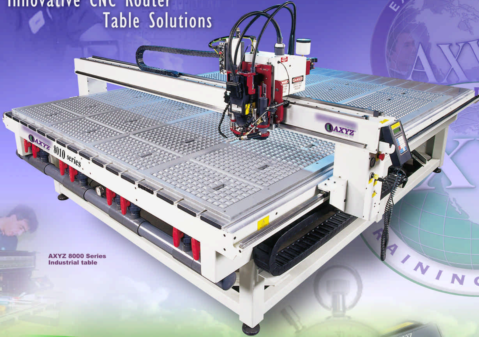
AXYZ 8000 Series Industrial table