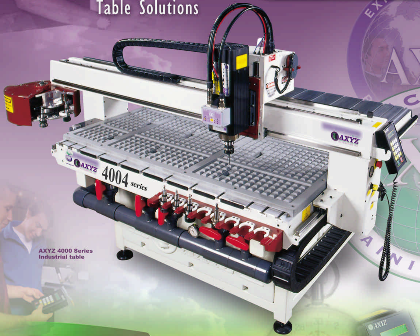
AXYZ 4000 Series Industrial table