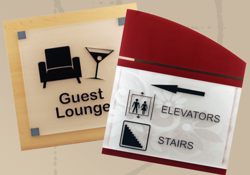
Architectural and Directional Signage

Expand Your Signage Business · With a laser, you can offer your customers more ways to serve them. Etch their company's awards, engrave promotional items and more.