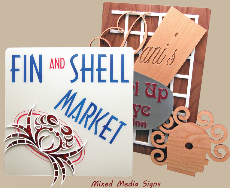
Mixed Media Signs