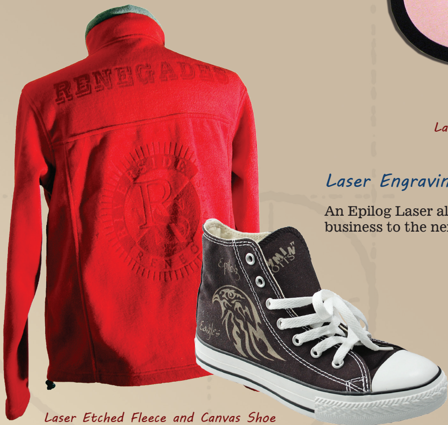
Laser Etched Fleece and Canvas Shoe