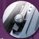
Material transfer rollerball system