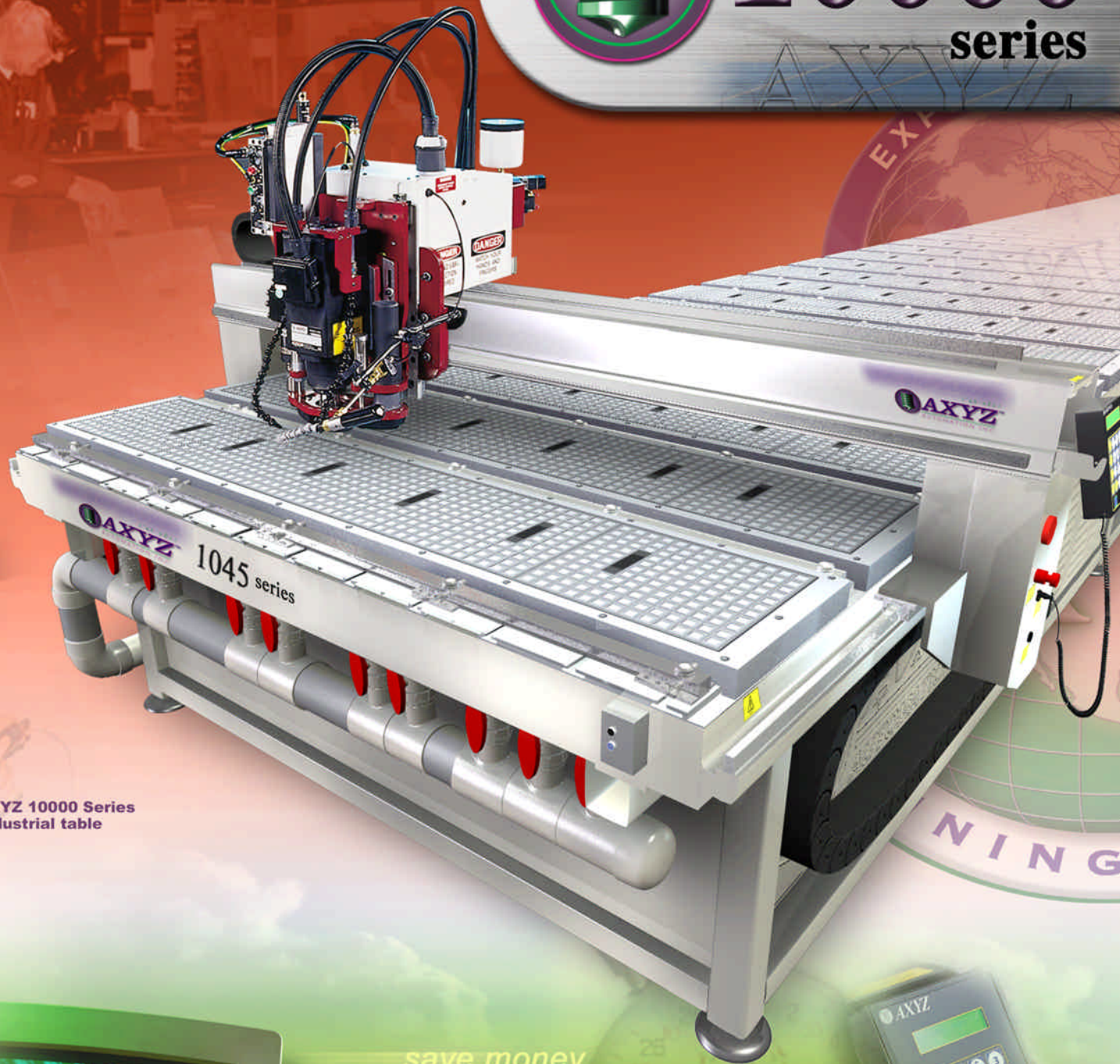
AXYZ 10000 Series Industrial table